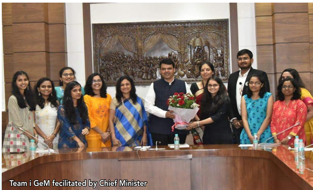
Team i GeM felicitated by Chief Minister