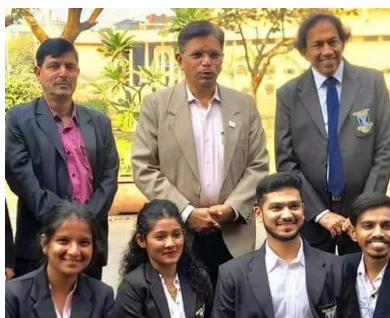
Winners of Avishkar with Vice Chancellor