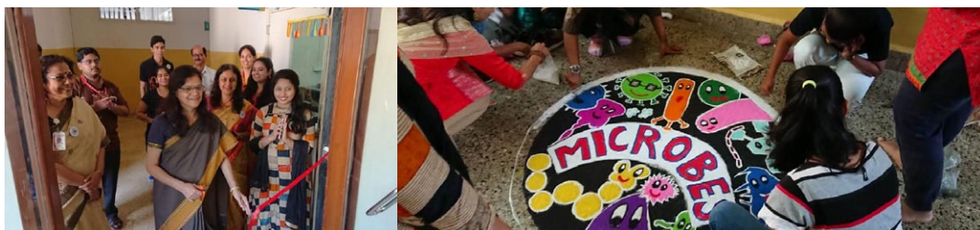
Inauguration of Microbes-Annual Biodiversity Fest

The Faculty of Science comprises of 14 full-fledged departments (Bioanalytical Science, Biochemistry, Biotechnology, Botany, Chemistry, Computer Science, Herbal Science, Information Technology, Life Science, Mathematics, Microbiology, Physics, Statistics and Zoology). The College has a long tradition of research. The activities of the departments encourage and foster a research culture amongst the students. The linkages and collaborations developed, by the departments, with various organizations help in training students in various fields and also provide an appreciable value addition to the academic programmes. Some of the most distinguished research scholars and scientists have been members of these departments.