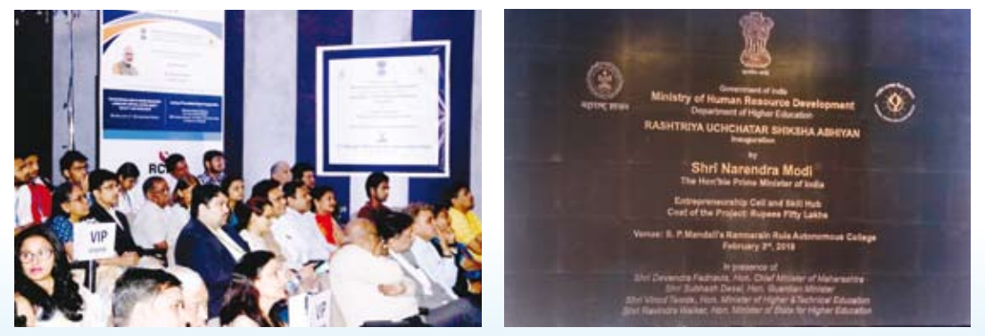
Digital Launch of Entrepreneurship Cell under RUSA